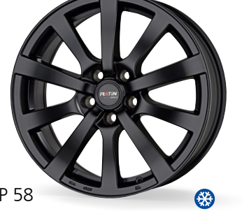
15-18 inch black mat